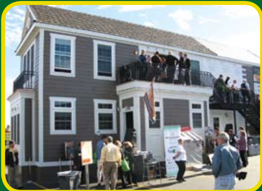
NextGen urban living home by Genesis division of Champion Enterprises wows IBS 2009

2009 International Builders' Show Report Inside!