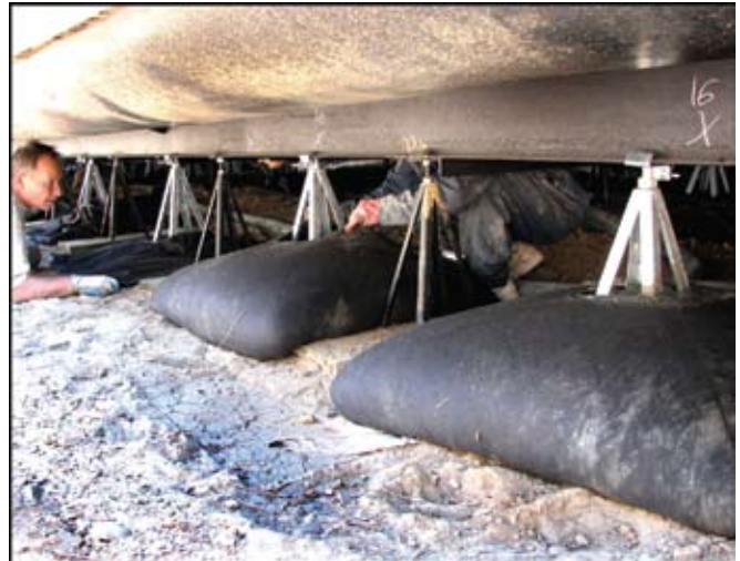
Sure Safe EFS foundation buttresses with some geo-textile bags already filled with concrete which form FHA approved permanent foundations beneath HUD-Code and/or modular homes.